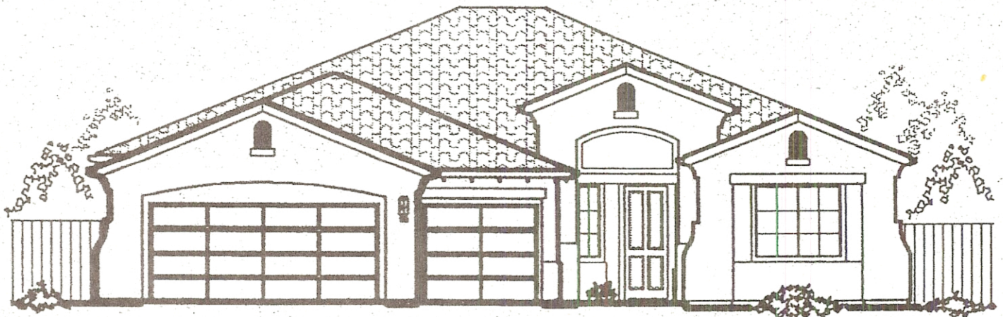
C - California

Prices, terms and availability subject to change without notice. Heritage Lakeside residents must be fifty-five (55) years of age or older, or if married one spouse must be 55 years of age or older. Facilities and services are planned to meet the physical and social needs of persons 55 years of age or older with accordance with the Fair Housing Act and regulations.