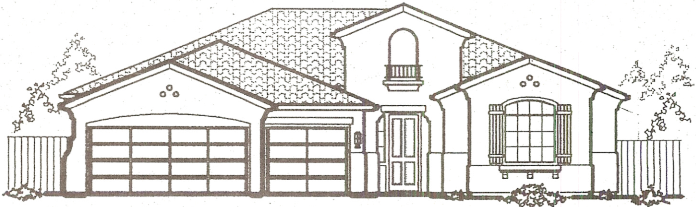
C - California

Prices, terms and availability subject to change without notice. Heritage Lakeside residents must be fifty-five (55) years of age or older, or if married one spouse must be 55 years of age or older. Facilities and services are planned to meet the physical and social needs of persons 55 years of age or older with accordance with the Fair Housing Act and regulations.